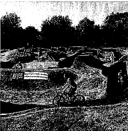
Hawkenbury Pump Track

A pump track is a circuit of rollers, banked turns and features designed to be ridden completely by riders "pumping"—generating momentum by up and down body movements, instead of pedaling or pushing. [1] It was originally designed for the mountain bike and BMX scene, and now, due to concrete constructions, is also used by skateboard and scooter riders, and accessible to wheelchairs. Pump tracks are relatively simple to use and cheap to construct and cater to a wide variety of rider skill levels. (Souce: Wikepedia)