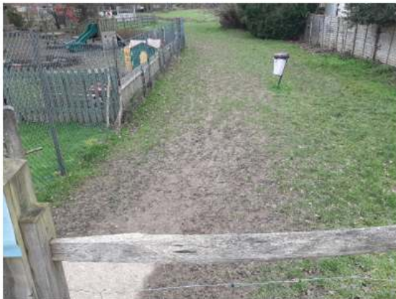
In this photo you can see how muddy it gets at the other narrow access point by Dauxwood preschool.

This plan will also require the moving of the newly installed dropped kerb on the new turning circle. It seems a shame to do this considering the substantial cost of the access road. We don't see that this could be done for £500 as they are suggesting.