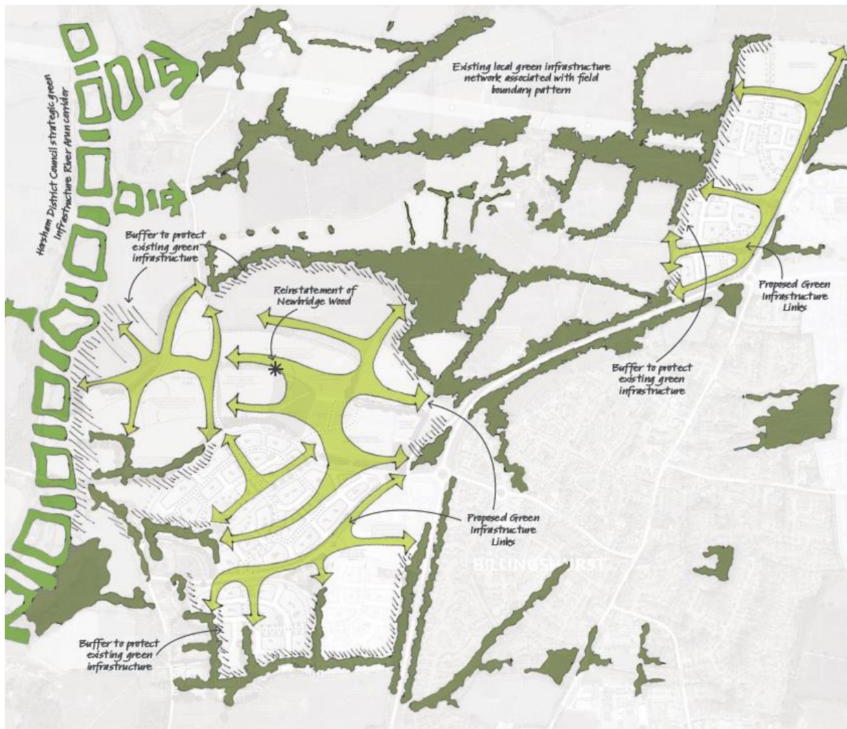
Green Infrastructure Diagram